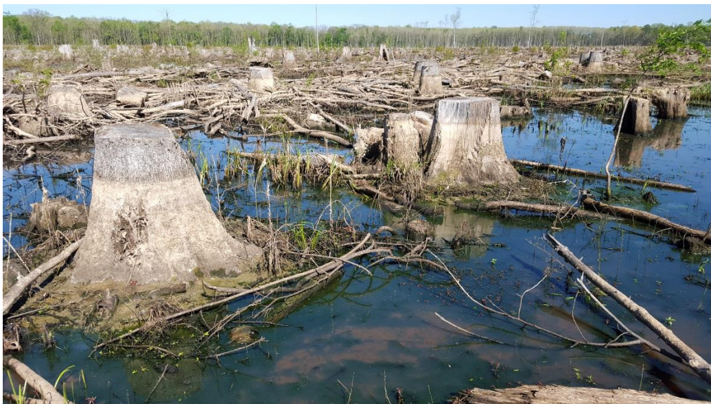
Photo: Logging site from which Enviva pellets have been sourced, North Carolina, Dogwood Alliance

All pellet mills operated by Enviva, with whom MGT Teesside has signed a supply agreement for around 1 million tonnes a year, are based in the North Atlantic Coastal Plain region. This area was declared a global biodiversity hotspot in 2016 and contains some of the most biodiverse temperate forest and freshwater ecosystems in the world. Enviva's own data shows that at least half of the wood it sources is obtained from hardwood forests, much of it from wetland forests 12 . Hardwood from the region comes entirely